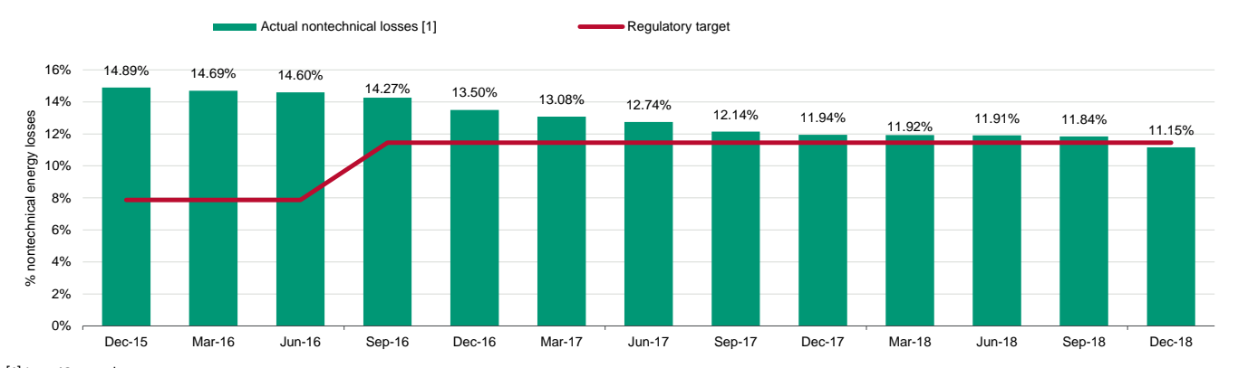
Exhibit 3 Nontechnical losses have been consistently decreasing due to higher investments

[1] Last 12 months average