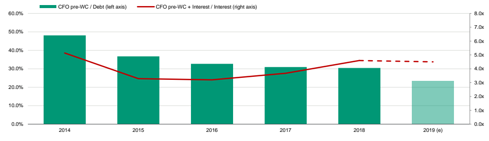
Exhibit 1 Capital spending and working capital needs will constrain improvement in credit metrics in 2019

Constraining EDP - Espirito Santo's credit ratings are (1) the company's increasing leverage to support capital investments to upgrade the network and prevent losses before the next tariff review cycle in August 2019, (2) the expectation of high dividend distributions to the parent, and (3) the exposure to high working capital needs according to hydrological conditions. The rating remains somewhat constrained by <a href="mailto:Brazil's Government rating">Brazil's Government rating</a> (Ba2 stable), given the intrinsic links between the company and the credit quality of sovereign due to its regional customer base.